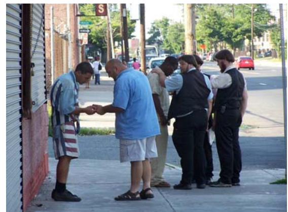
Amish brothers praying for residents in Newark's Seth Boyden neighborhood during our 'Operation Saturation' exercises in July.

To unite ministers committed to the gospel of Jesus Christ with service providers, government entities, and businesses, for the enhancement of life, liberty and the pursuit of happiness of persons within the urban setting.