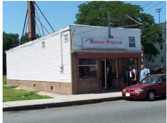
The Manna Station on 16th Avenue has weekly outreach events and is the hub for 'Operation Saturation'.

The Argentineans we met were ready to travel along their religious journey as trusting children of God, not as worldly wise theologically astute scholars. Now don't take me wrong on this; we are not told to throw away our brains to become Christians. However, we are taught to live in a way that is often upside down to the world and its conventional wisdom. To do that, we must go back and experience the gift of salvation, the magnificence of God, and the wonders of grace as wide-eyed, excitable children who trust in God's ways, God's love, and God's care and be open to receive from Him.